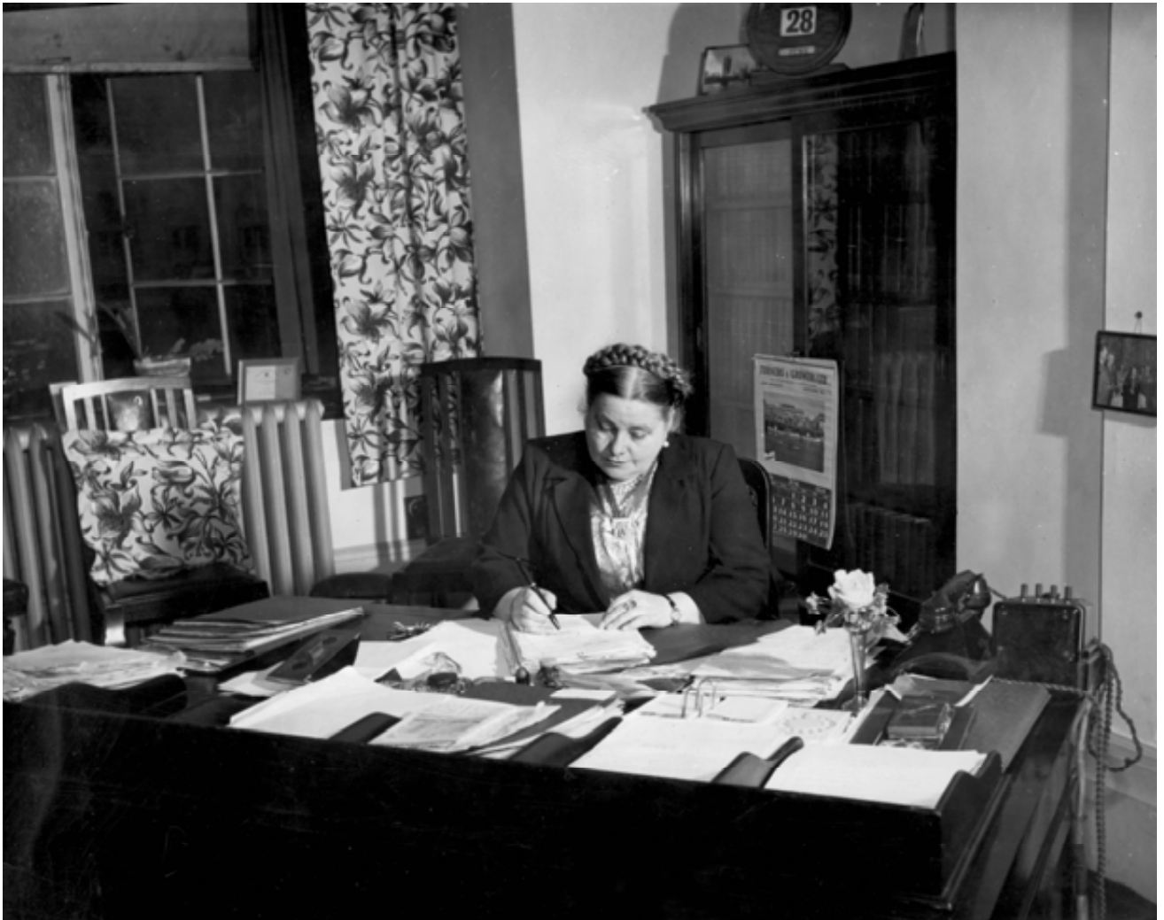
New Zealand Minister of Health Mabel Howard in her office, 28 June 1949 [E.J. and Mabel Howard papers, MS-0980/286].